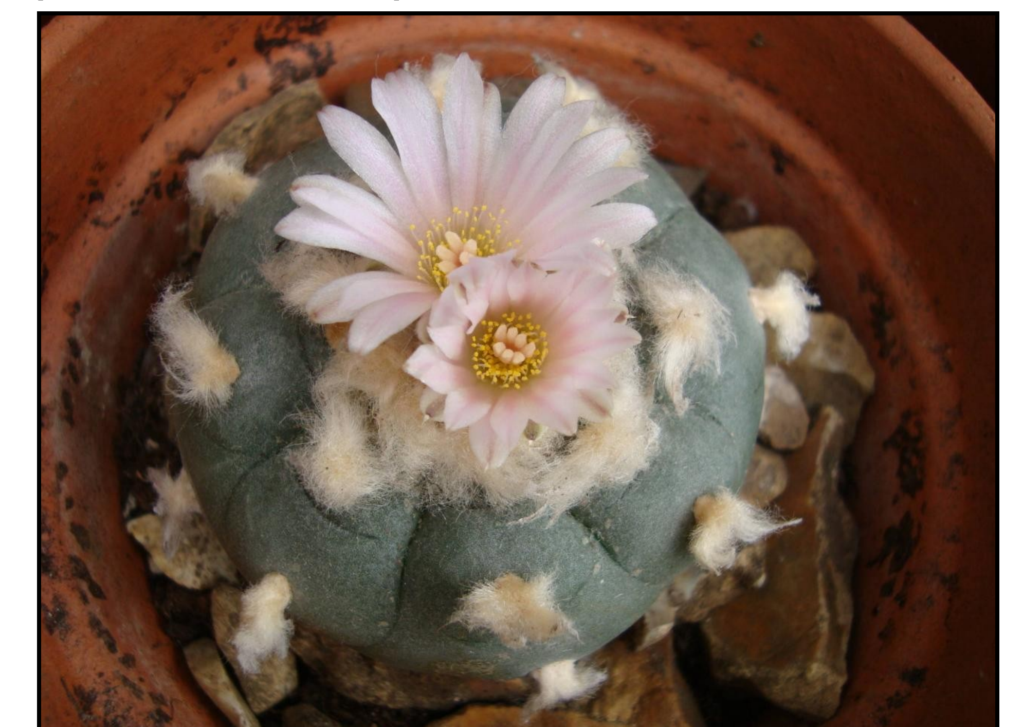
Above: A peyote cactus in bloom