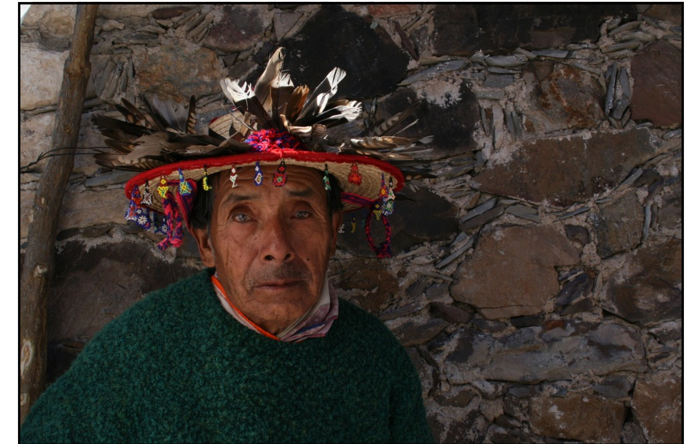
Below: A Huichol shaman sporting traditional headwear