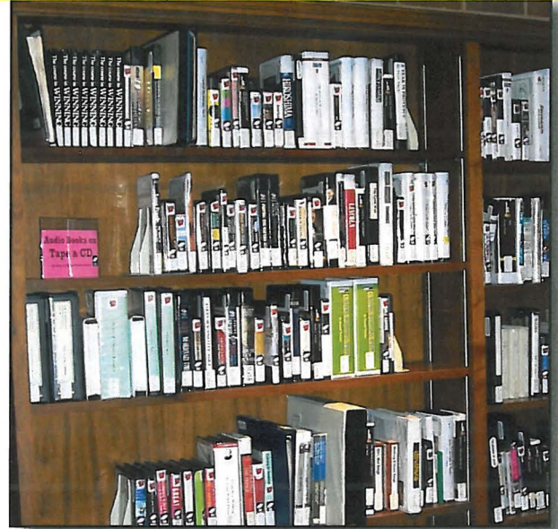
Audio books and music CDs available for use when travelling.

And if you don't want a book to READ, try some music CDs! There are thousands of them for your listening pleasure.