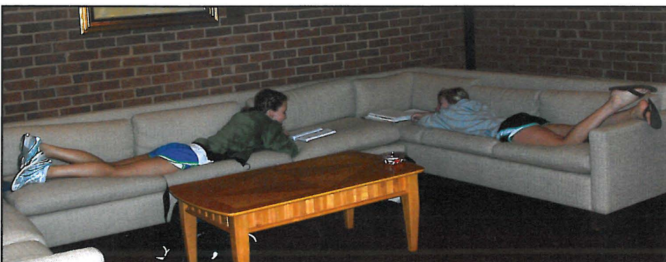
Students make full use of newest study furniture.