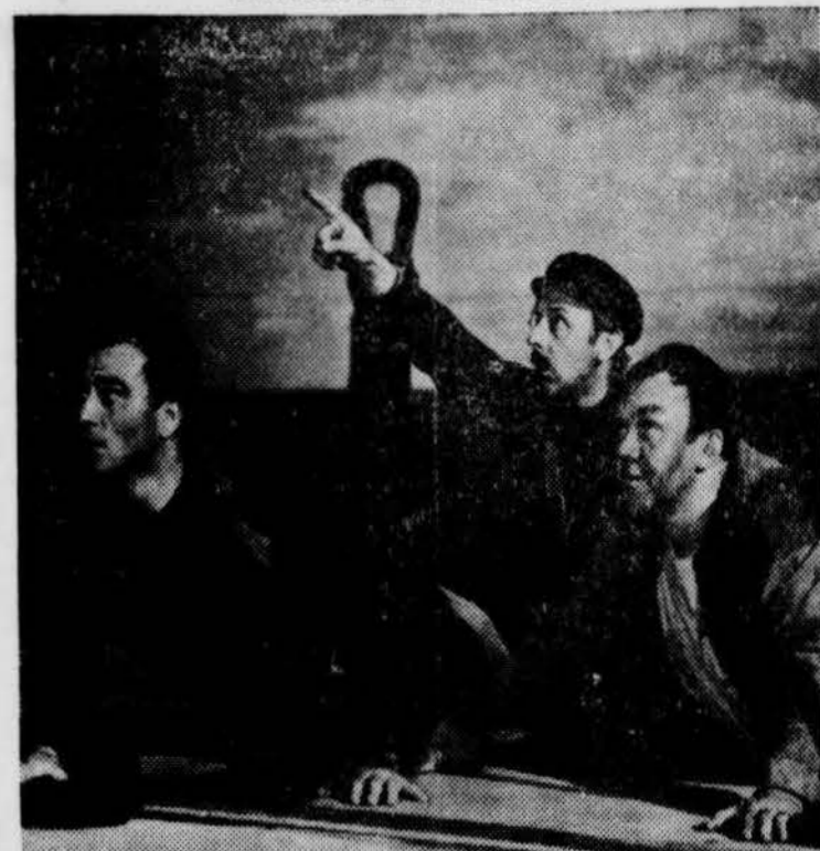
The actors in "The Long Voyage Home" at the State tomorrow undergo a bombardment by air and sea. Leading characters are John Wayne and Thomas Mitchell.