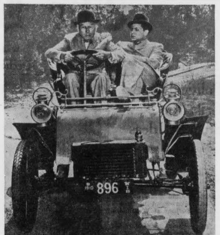
Fred Allen and Oscar Levant as they appear in O. Henry's "Full House" coming Tuesday and Wednesday to the State.

He turned around and went back upstairs. The girl he had kicked coming down didn't notice him as he passed her. When he got to the foyer, the group that was there before was gone. All that was left were ashes. He picked up his coat with his left hand. In his right was a paper bag. Downstairs, somebody had put on "Dancing in the Dark."