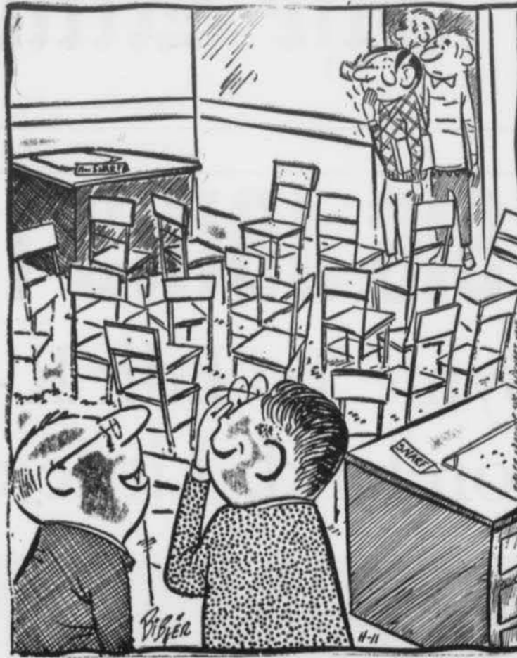
"I put a desk at both ends of the classroom. It confuses heck out of those students who always sit on th' back row."