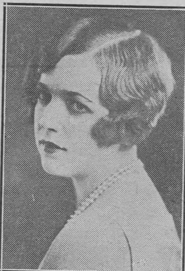
Mrs. E. H. White