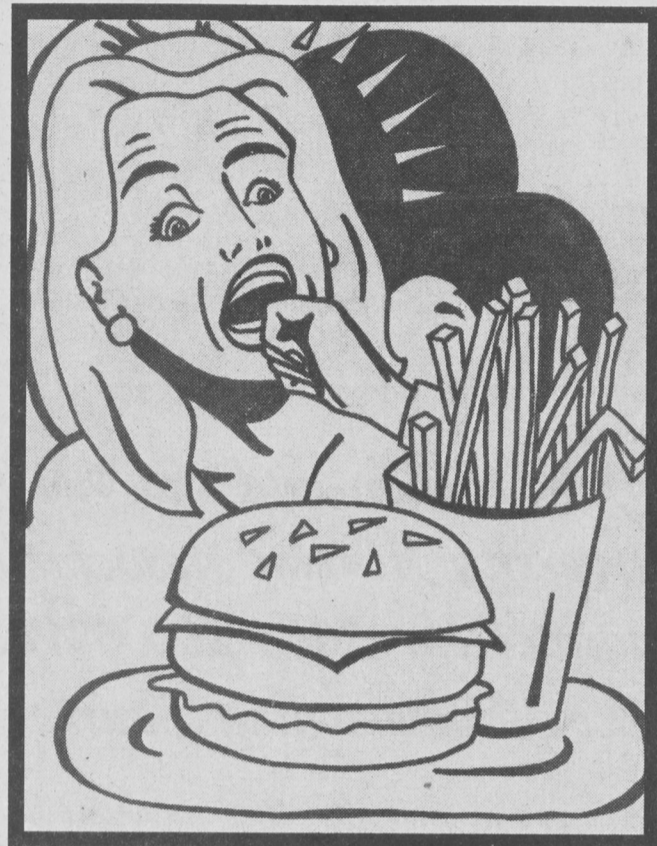
ILLUSTRATION BY EMILY HULEN

Students interviewed chose to remain anonymous due to the sensitive nature of the topic.