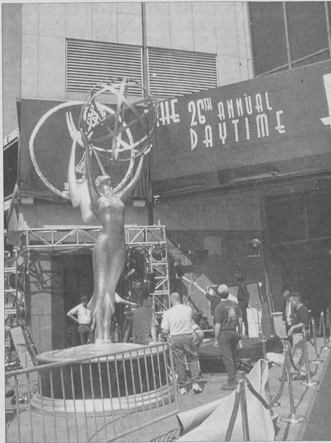
POMP AND CIRCUMSTANCE. The subjects that are honored by the Emmys, Grammys, and Oscars aren't the only things that count in life

Being a big fan of tv and movies, I dutifully sat and watched the Emmy awards last Sunday night. Elaine Stritch's warning that she would not leave the stage until someone carried her off and Sarah Jessica Parker's thanking of the "passerbys who always wanted the best for her" made me realize that such an award truly is a result of the culmination of a lifetime of hard work. During high school and even before, I was often awarded with some sort of prize, most of which I only appreciated because they allowed me to add one more thing to my resume. I'm sure many of the students here can relate to my lack of enthusiasm at being praised and I began to wonder... Why are some awards more personally valued than others?