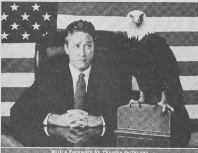
With a Foreword by Thomas Jefferson

Cheeky, irreverent, and playfully ingenuous, this abbreviated history of democracy is everything one would expect from the writers of Comedy Central's fake news program. The book is laid out like a textbook, with "Discussion Questions," "Classroom Activities," and plenty of amusing graphics. A must for Jon Stewart fans.