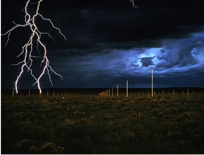
Figure 5: Walter de Maria, The Lightning Field (1977). Permanent earth sculpture: 400 stainless steel poles arranged in a grid array measuring one mile by one kilometer; average pole height 20 feet 7 inches, pole tips form an even plane. Quemado, New Mexico. in Arts of Wonder: Enchanting Secularity – Walter De Maria, Diller + Scofidio, James Turrell, Andy Goldsworthy , by Jeffrey L. Kosky, (Chicago: The University of Chicago, 2013), 16.

Now, with the illusion of absolute truth stripped from both a scientific explanation and from a religious explanation, the world is plagued with the reality of an interminable uncertainty.