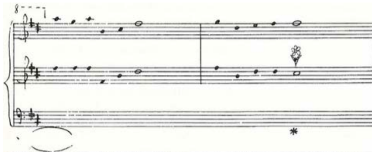
Figure 2: Arvo Pärt, Für Alina , 1976, Original score, from Hillier, Arvo Pärt , 88-89.

The notes themselves follow a strict methodology that never strays from the fundamental guiding rule of the single triad, like the ringing of a bell. The low B repeated and sustained throughout the piece roots the short work in its B-minor tonality without changing keys. The one aberration from this strict methodology comes in the eleventh measure when the left hand strays