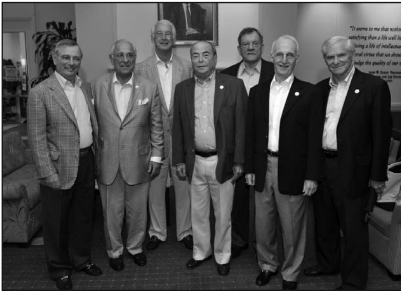
Hillel's Reunion Reception honored the ZBT Class of 1959. Their 50th reunion leadership gift to the new Hillel House was over $1.1 million.