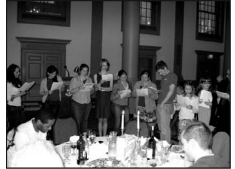
Passover: Over 100 people attended Hillel's Community Seder.