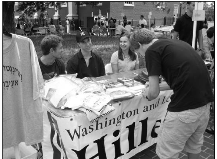
New students learn about Hillel activities at the Student Activities Fair in September.