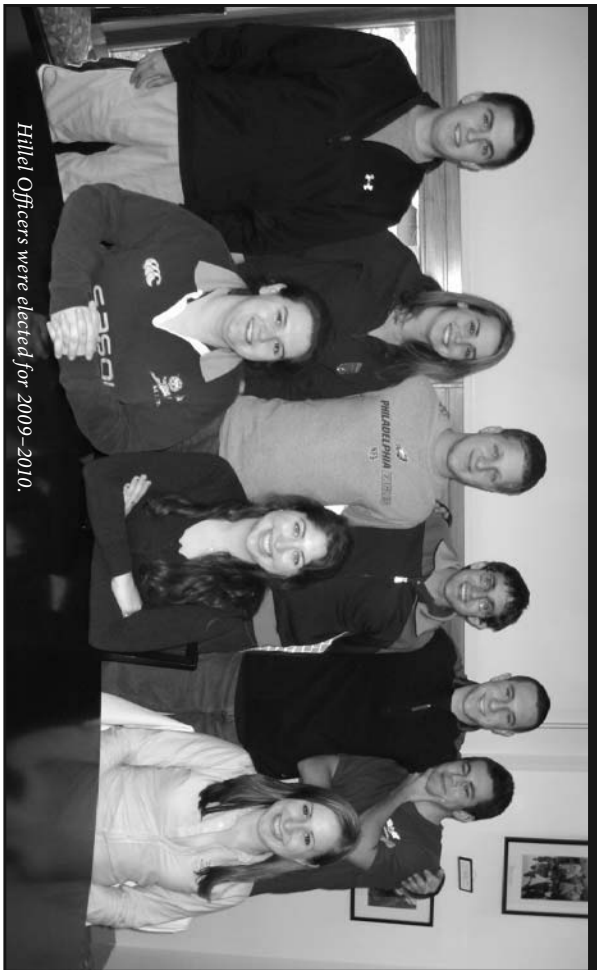
Hillel Officers were elected for 2009-2010.