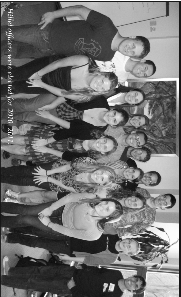
Hillel officers were elected for 2010-2011.