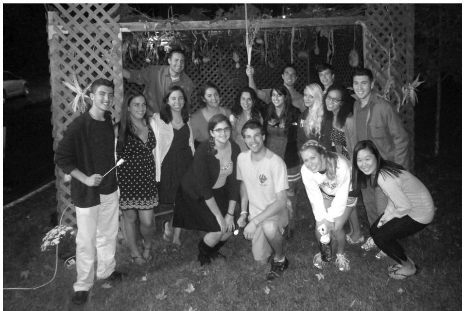
Students in front of our Sukkuah

from their bags and soon the jockeying for prime roasting positions began. Each person provided the group with the “best way” to toast a marshmallow to that perfect golden brown, until they noticed that theirs had just burst into flames. The combination of graham crackers, chocolate, and burnt marshmallows brought to light perfectly the sense of community and warmth of Sukkot. Or, maybe it was the fire that supplied the warmth. No worries, nothing quite says Sukkot like good food and good company.