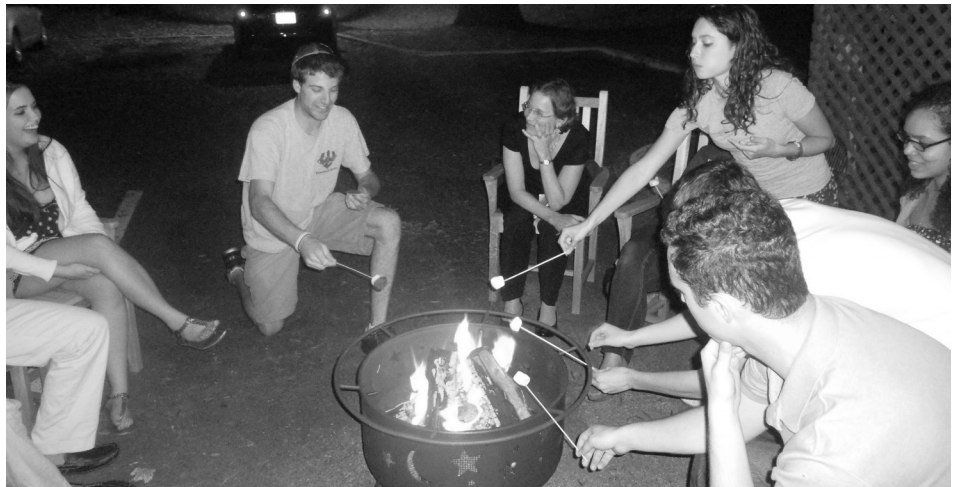
Students roasting smores and having a good time during Sukkot

“Everyone loved having time to sit and converse with their families within our Hillel House—our ‘home away from home.’”