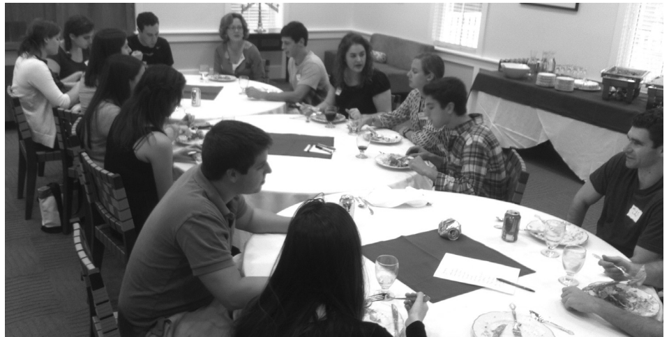
VIP dinner with everyone enjoying the conversation