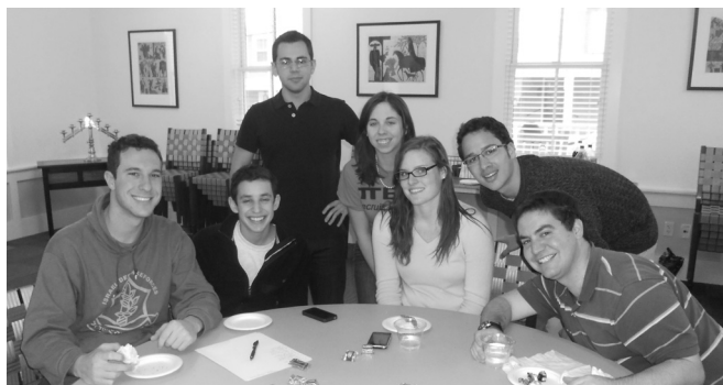
Students enjoying themselves during Simchat Torah