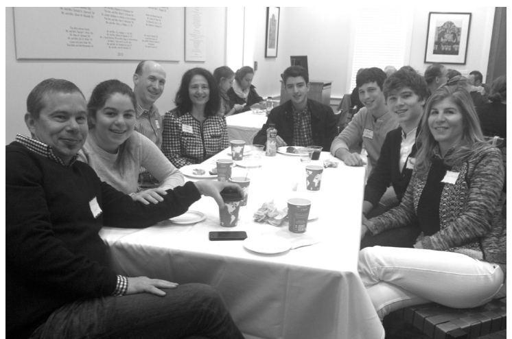
Parents' Weekend: We enjoyed meeting so many families during the Sunday morning bagel brunch and our Fridays at Five Shabbat services and dinner