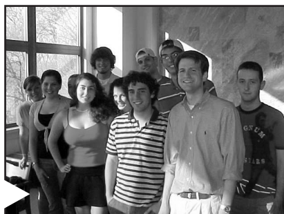
The "Jew Crew" 2005-06