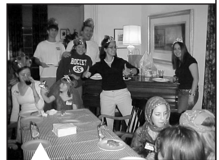
Students and local children enjoy a festive meal during Purim Party at the Alumni House.