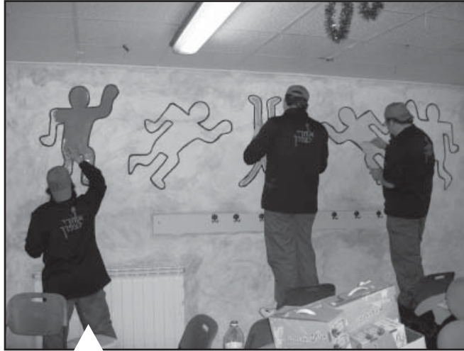
Painting a colorful mural in a bomb shelter in Northern Israel—Carly's group of 550 volunteers painted 3.5 kilometers of wall.

JNF volunteers were on call 24 hours a day to put out these fires that had the potential to destroy huge amounts of forestation. The underbrush is what fuels these fires, and our job was to clear the pruned "branches" (they were more like whole trees) to prevent a fire from spreading after a rocket hit.