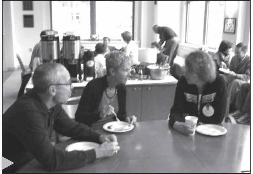
Parents' Weekend: We enjoyed meeting so many families during the Sunday morning bagel brunch and First Fridays at Five Shabbat services.

Looking forward to the rest of the semester, we have our annual Hanukkah party and finals study break in December. With such a great start to the year, this is bound to be another great year for Hillel at Washington and Lee.