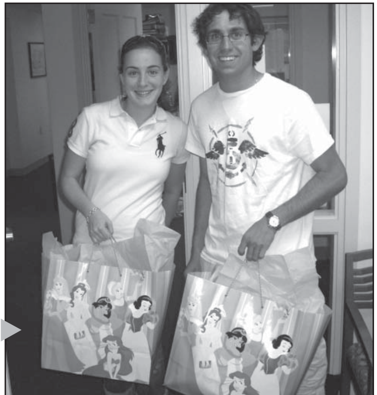
Students shopped for a local child with funds from the Novack Fund.