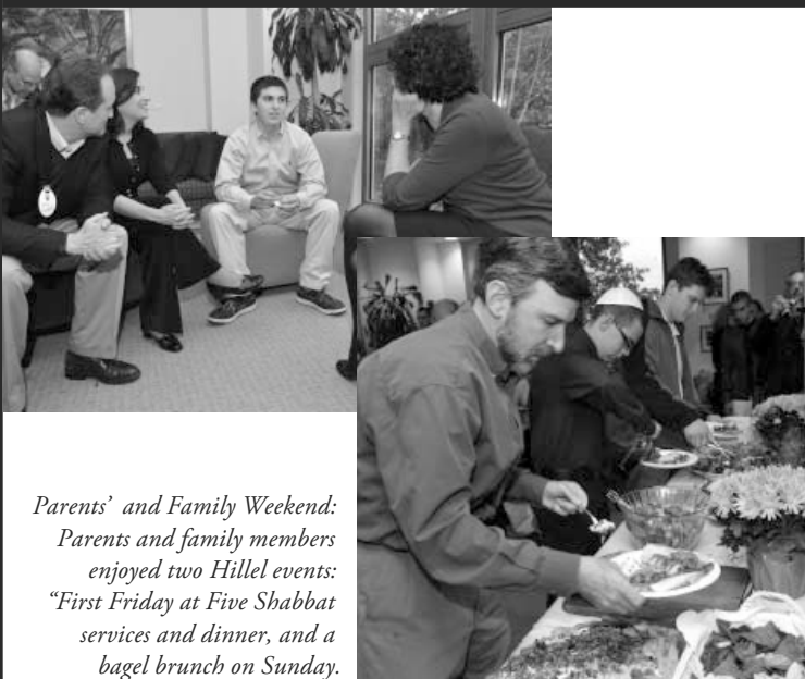
Parents' and Family Weekend: Parents and family members enjoyed two Hillel events: "First Friday at Five Shabbat services and dinner, and a bagel brunch on Sunday.