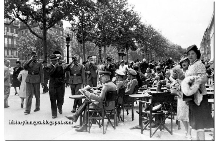
German soldiers at a sidewalk cafe in France during WWII