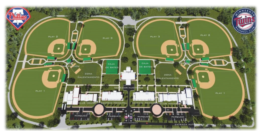
Image 3: The Phillies and Twins joint academy in Boca Chica. (Rand, 2017)

The most recently renovated academy is the jointfacility between the Philadelphia Phillies and the Minnesota Twins. This academy complex is a central example of the type of