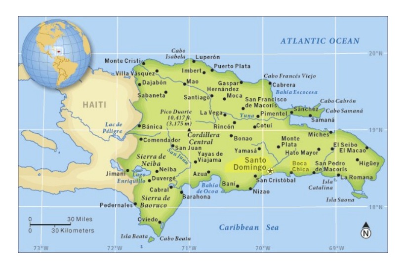
Image 2: The four major cities for academies are located on the southeast side of the island: Santo Domingo, Boca Chica, San Pedro de Macorís and La Romana. (University of South Florida, 2017)

Dominican teenagers step foot into the academy their life immediately changes and they become one step closer to success. Today, most of the academies are located in San Pedro de Macorís, La Romana and Boca Chica. There are also a few located in