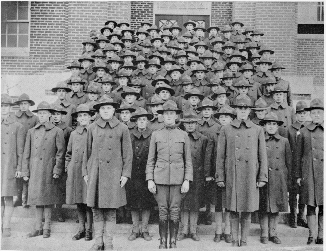
Student Army Training Corps at Washington and Lee in 1918. How many of them can you identify?