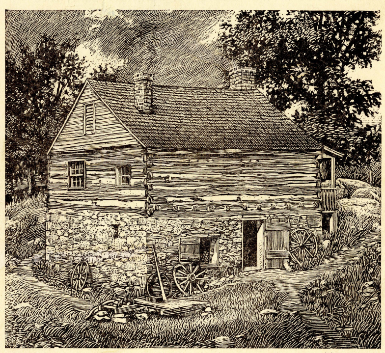
Log Shop on Walnut Grove Farm, near Steele's Tavern, Virginia

Washington and Lee University Lexington Virginia